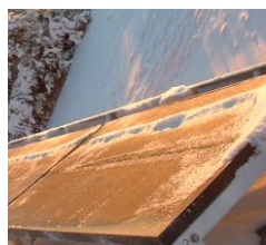
Siemens PV Panels 10 x 40 watts