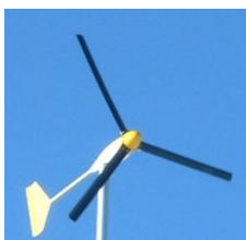
Bergey XL 1kwh Wind Turbine 60 foot tower