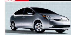
Toyota Prius Hybrid Motor Trend Car of the Year